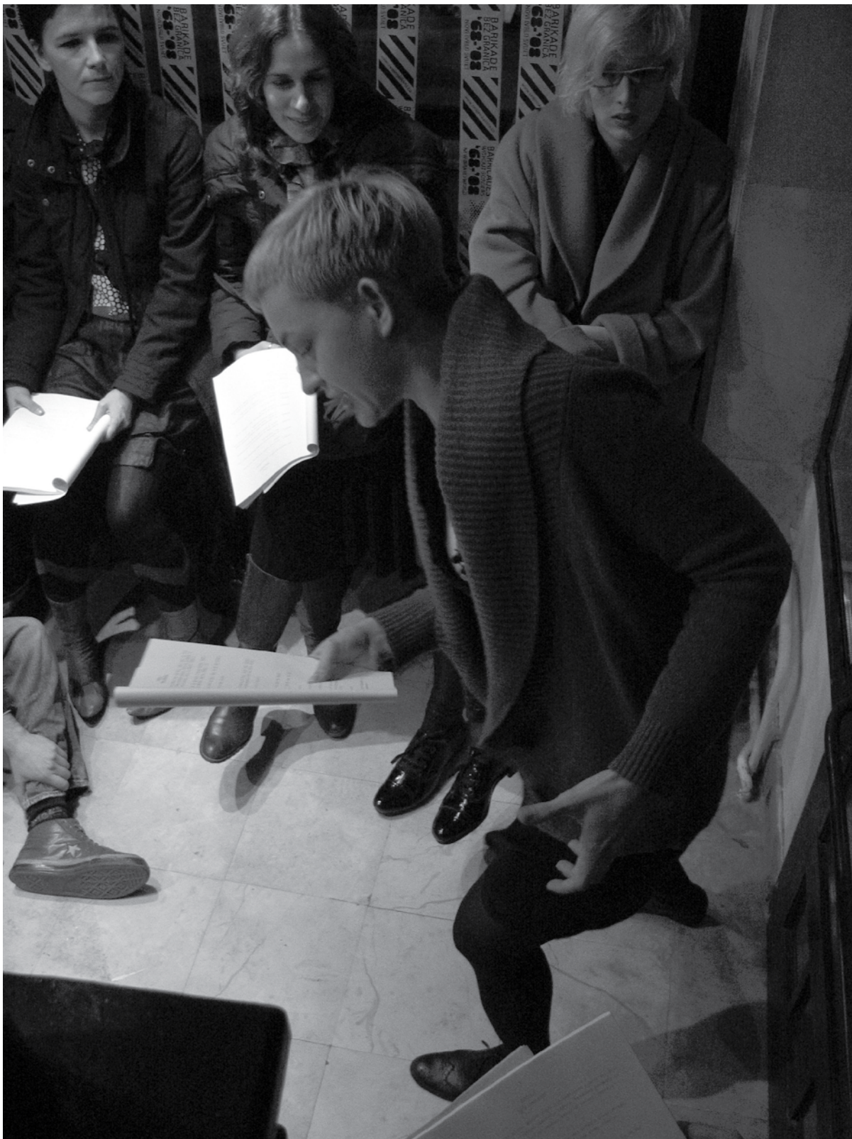
FIRST READING IN 10 M 2