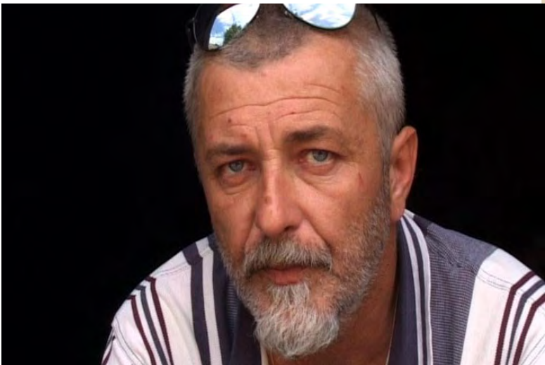
Individual Utopias, Testimonials, 2008, 35", video still