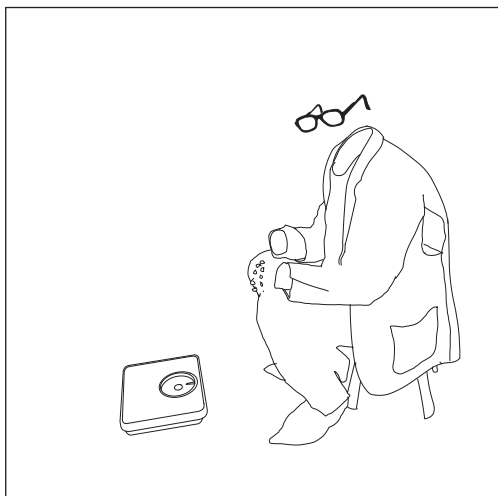
Invisible Man , 2005, K3 ultrachrome print on canvas, 60 x 155 cm