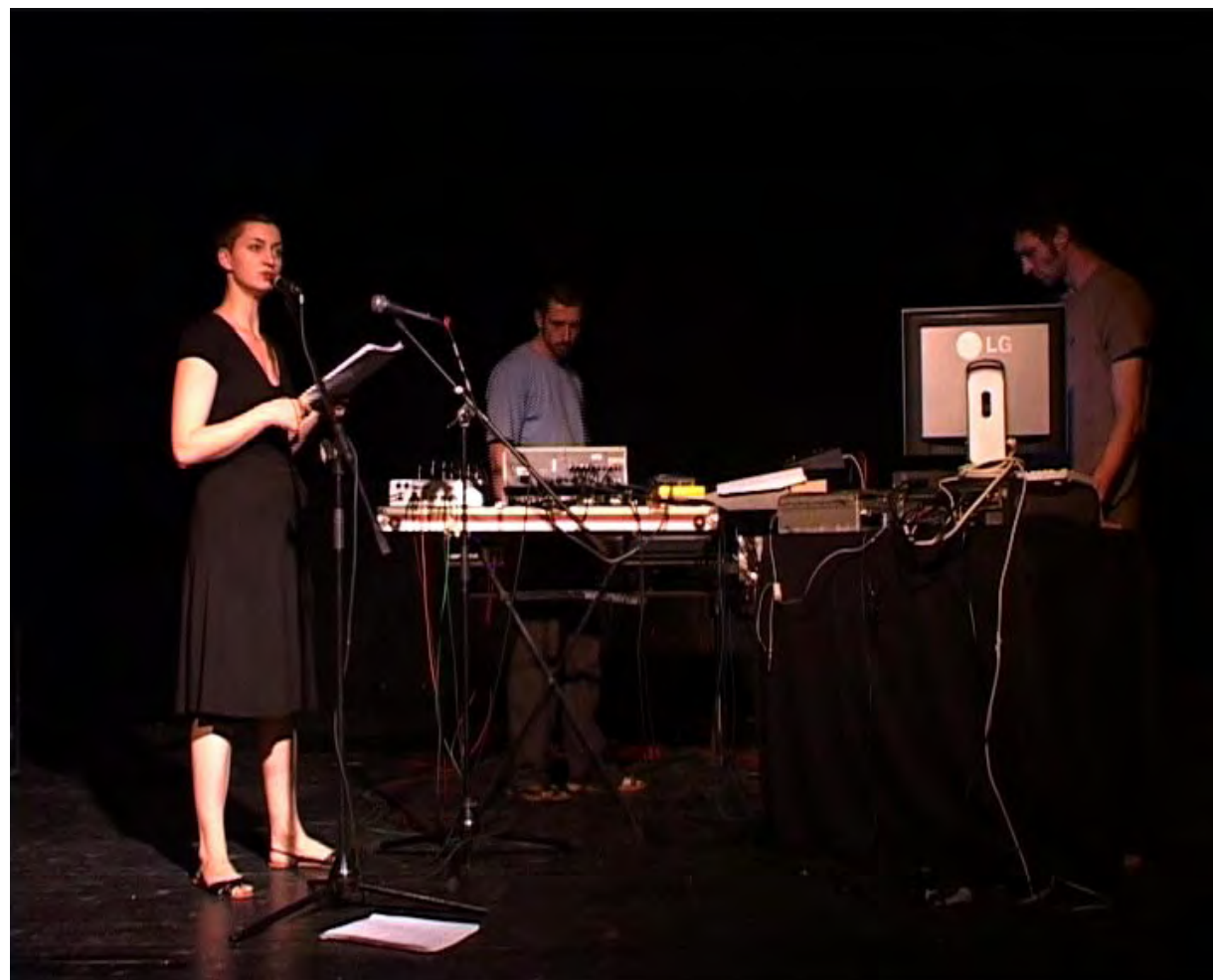
Individual Utopias , 2008, 35', video still

http://www.youtube.com/watch?v=xw5DqydVuX4