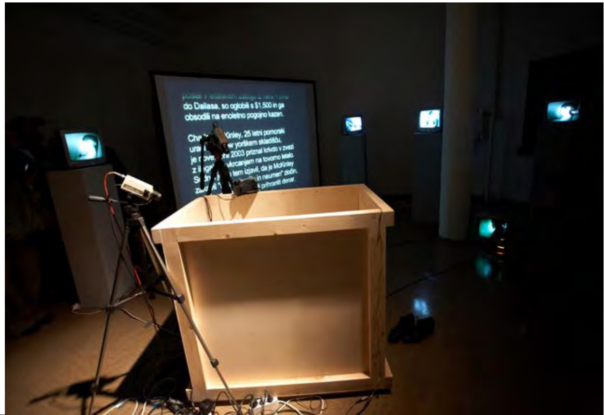
Travel in the Box , 2009, performance