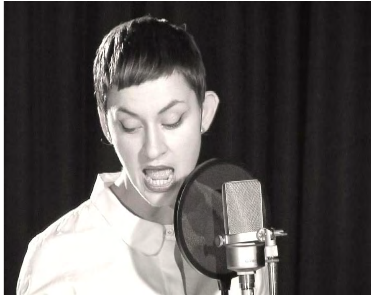
Sorry Wrong Number , 2006, 15', video still

The moments when image and sound are in sync seem uncanny as it becomes evident that the distorted voices are in fact, belonging to the performer. The impossibility of synchronization of audio with the video and with each other comments on the impossibility of communication, it talks of isolation. The same theme is present in the very narrative of the radio play. The main storyline is about an invalid woman who spends all of her days in her room. Her only link to the outside world is her telephone. One night she gets the wrong connection and overhears a plan for a murder. While desperately trying to warn the police, she realizes that she has overheard the plan for her own murder.