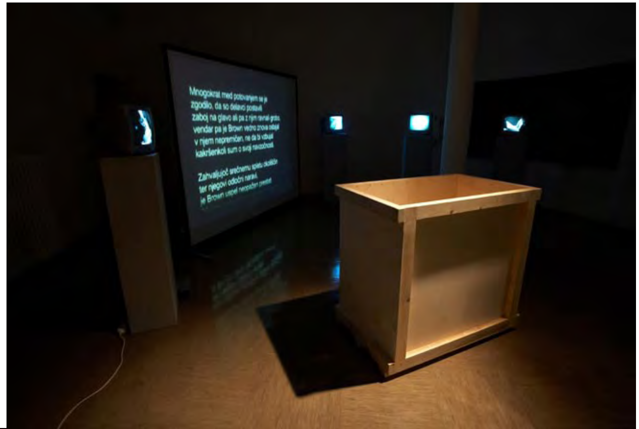
Travel in the Box , 2009, installation views