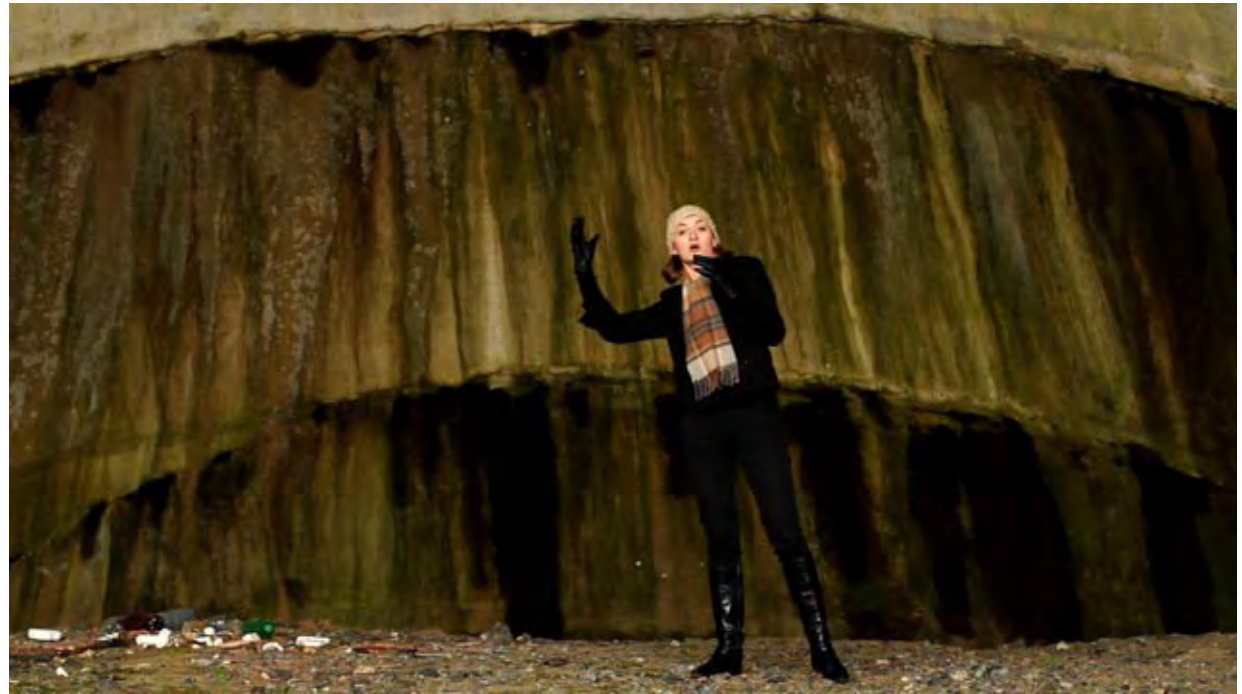
The Damned Dam , 20010, 36', video still

http://www.youtube.com/watch?v=Ph8xDH4kMm8