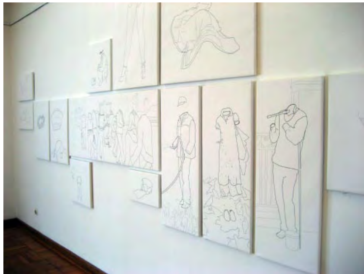
The Invisibles , 2005, drawing installation, dimensions variable