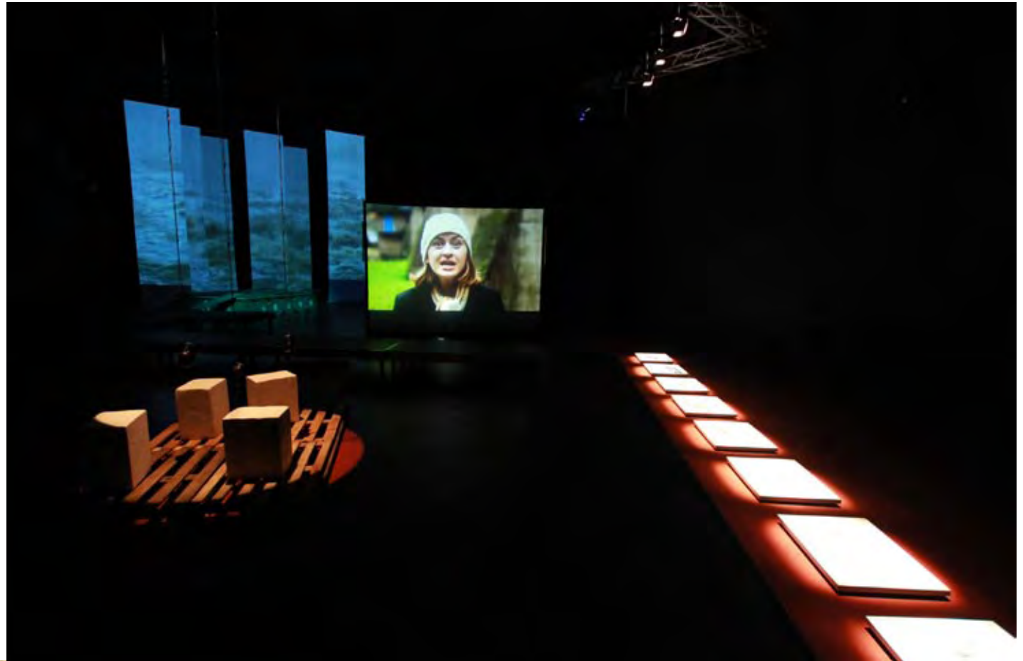
The Damned Dam , 20010, installation views