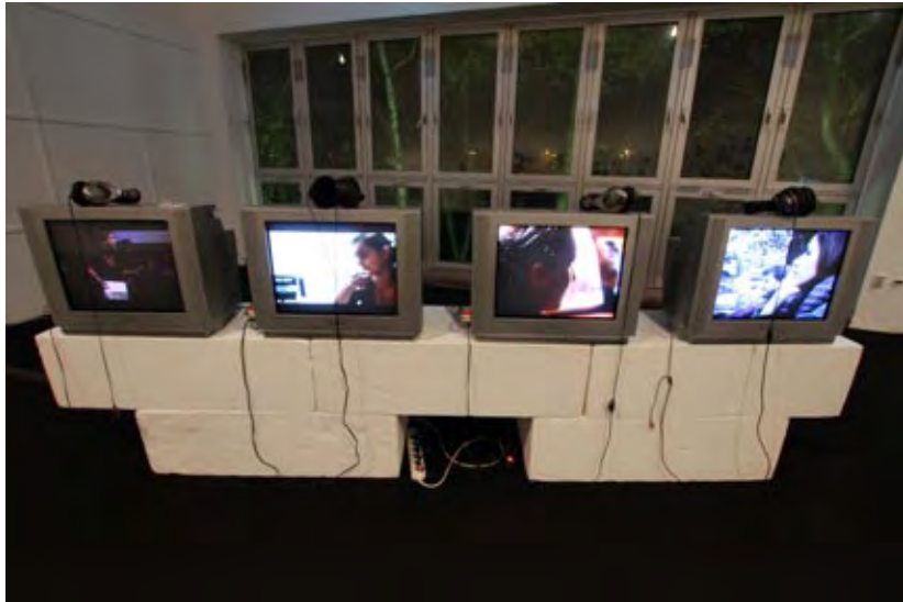
The Damned Dam, 2010, installation views