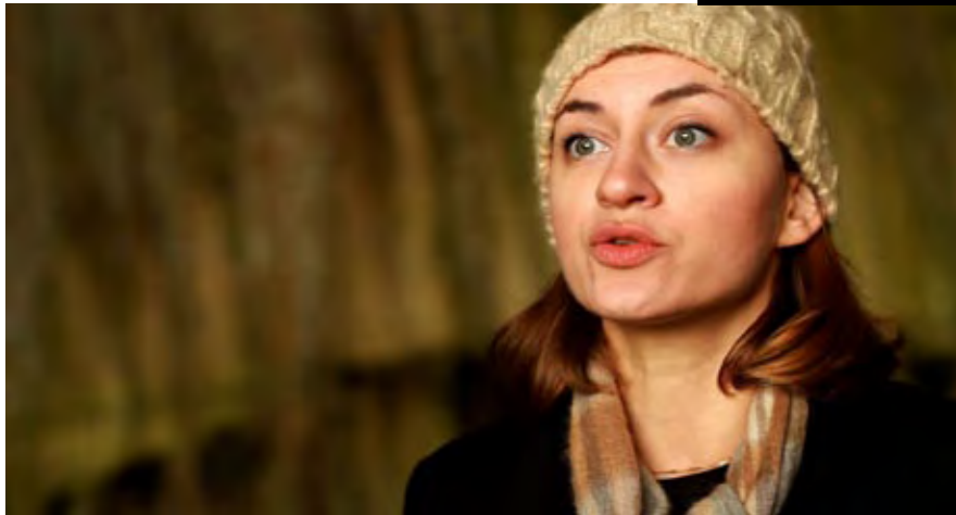
The Damned Dam , 20010, 36', video still