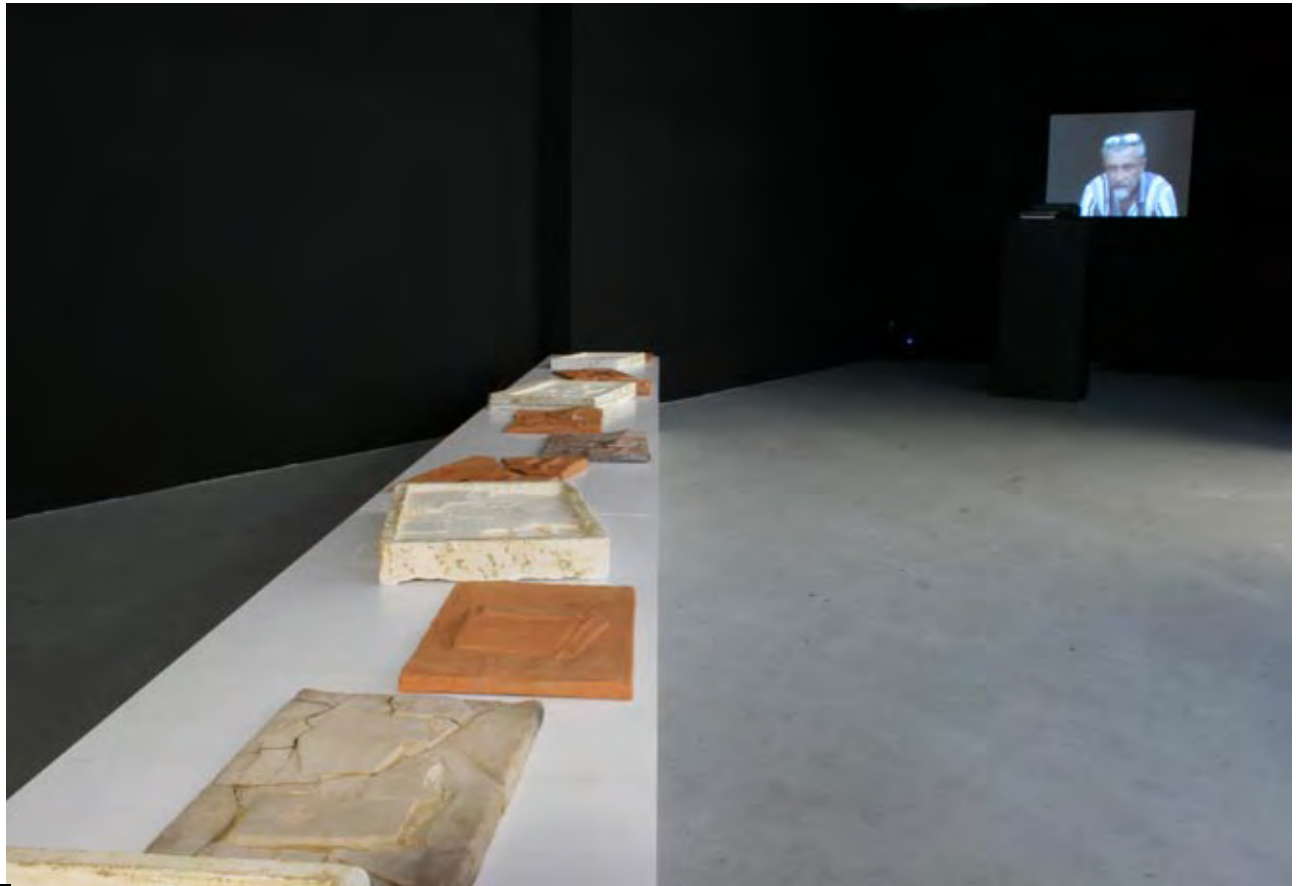
Individual Utopias, 2008, installation view