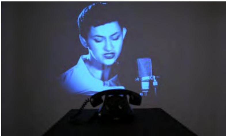
Sorry Wrong Number , 2006, installation views