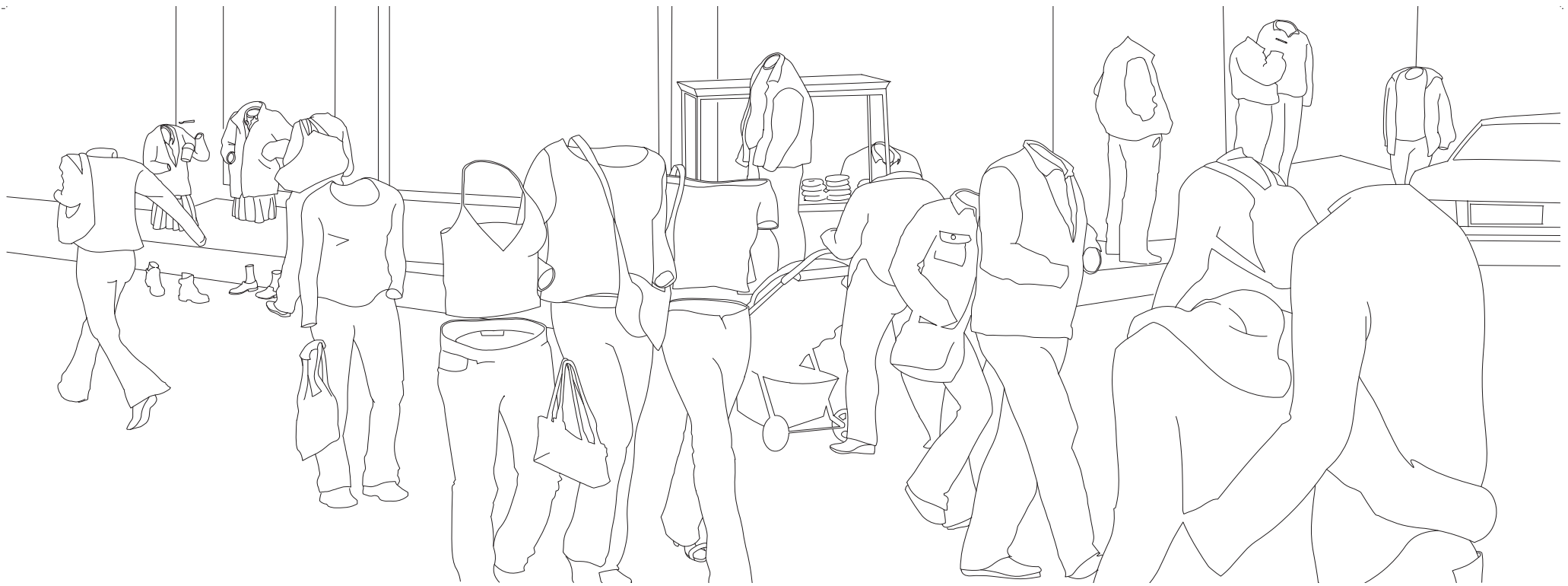
Invisible People , 2005, K3 ultrachrome print on canvas, 60 x 155 cm