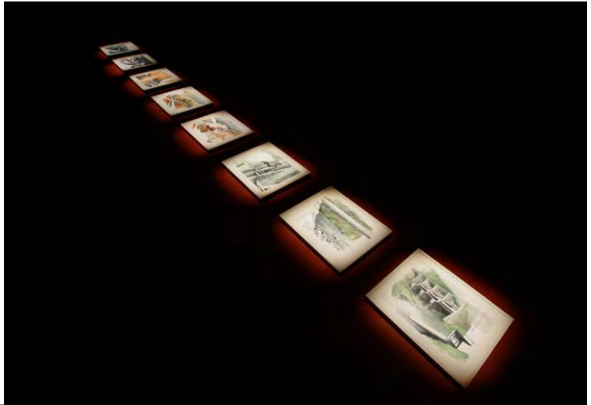
The Damned Dam , 2010, watercolors, installation view