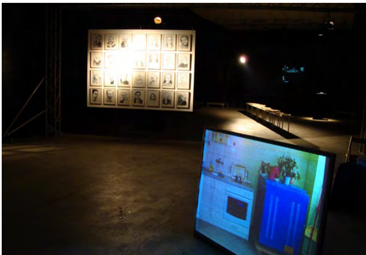
Individual Utopias , 2008, installation view