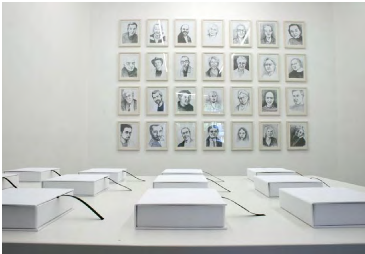
Individual Utopias, Characters, 2008, artist book and drawing installation view