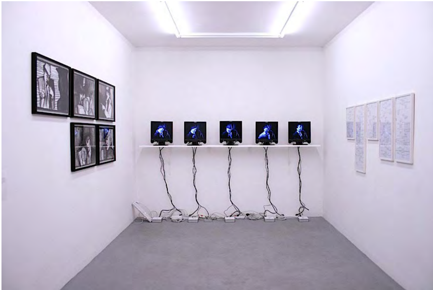
Everything is Connected , 2007, 5 channel video installation, 10' video stills, installation view