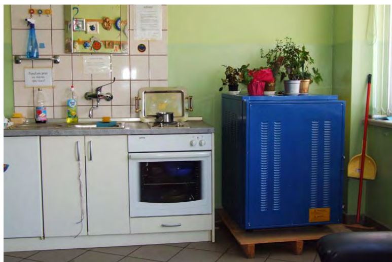
Individual Utopias, The Kiln , 2009, photo/slide projection