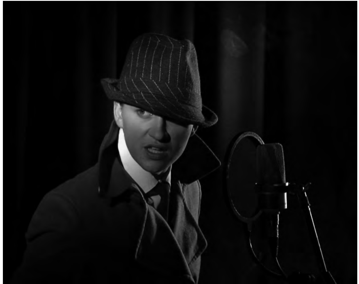
Everything is Connected , 2007, 5 channel video installation, 10', video still

Everything is Connected is a five-channel video/audio installation. On five monitors five characters are having a conversation. They are bosses of criminal groups. The story is set in a situation where they nameless criminals meet in a nameless space to discuss the fate of an unnamed kidnapped child. The video is black and white, the overall atmosphere evokes the "image" of the 1930's. Apart from costume and the camera work, what links us to this time-period is the media-motif of the audio drama; the characters are actually actors in an audio play. In the isolated ambiance of the anechoic chamber of the recording studio, a plot without a denouement takes place.