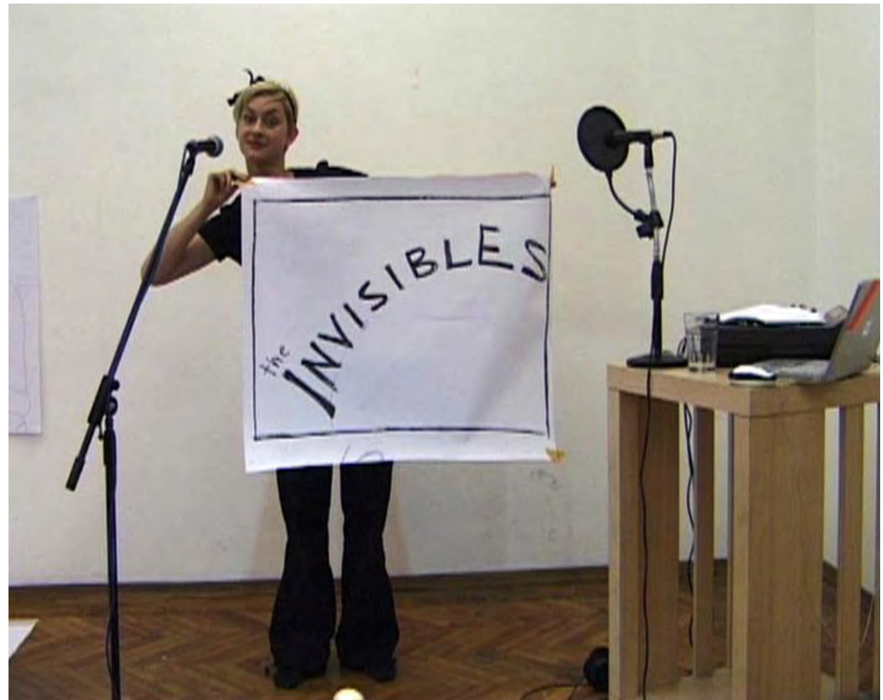
The Invisibles , 2005, 31', video still

As in the H.G. Wells novel The Invisible Man , the idea of physical invisibility in this project is used as a metaphor for the outsider, the socially outcast individual. The drawings touch upon the various aspects of invisibility: social and civil invisibility, the notion of escape, criminal activities, freedom, identity and the 'what-if' reality of a physically invisible person. Along with the prints, the main part of the project is a video showing a performance of an audio drama of the same name: The Invisibles . A story of an invisible family planning to go on a vacation is delivered through a conventional narrative structure. This light satire touches upon the absurdities of contemporary society: the bureaucratic mechanisms, collective paranoia and surveillance systems. This work is neither an audio drama nor a video in the full sense; it lingers as the "other", in between the two genres.